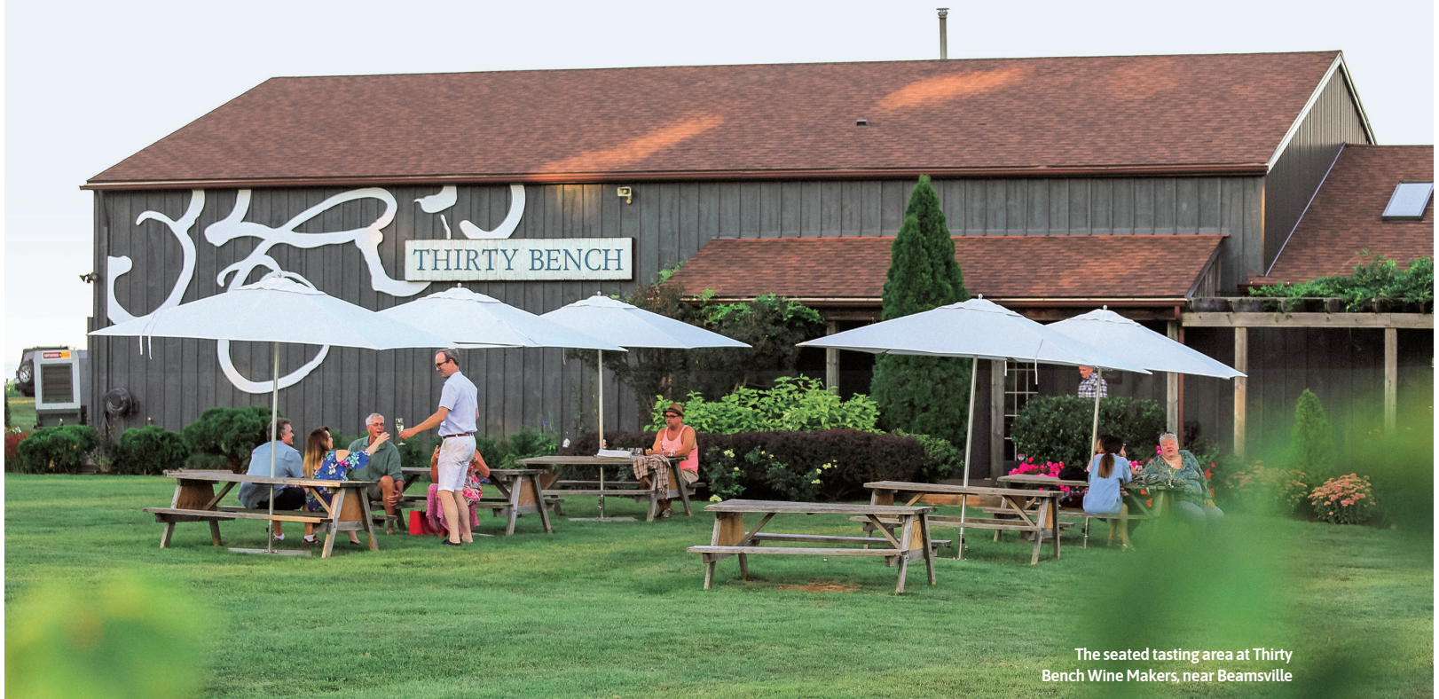
The seated tasting area at Thirty Bench Wine Makers, near Beamsville